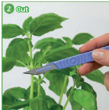
2 Cut Make a sharp diagonal cut below a leaf node