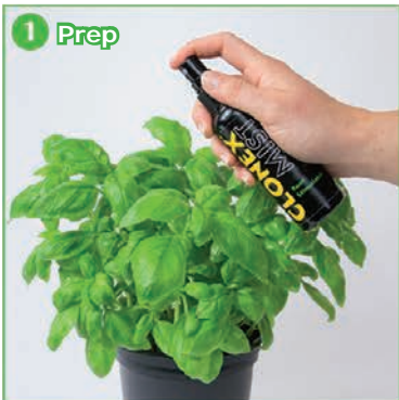
1 Prep Spray mother/donor plant a few days before taking cuttings