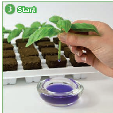
3 Start Dip cutting into Clonex Rooting Gel then straight into Root Riot cube