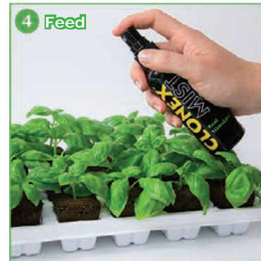
4 Feed Spray with Clonex Mist until roots develop, then feed with Clonex Clone Solution